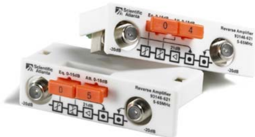
Figure 1. Reverse Amplifier 93146

If no reverse amplification is needed, a 0 dB link type 74069 is used.