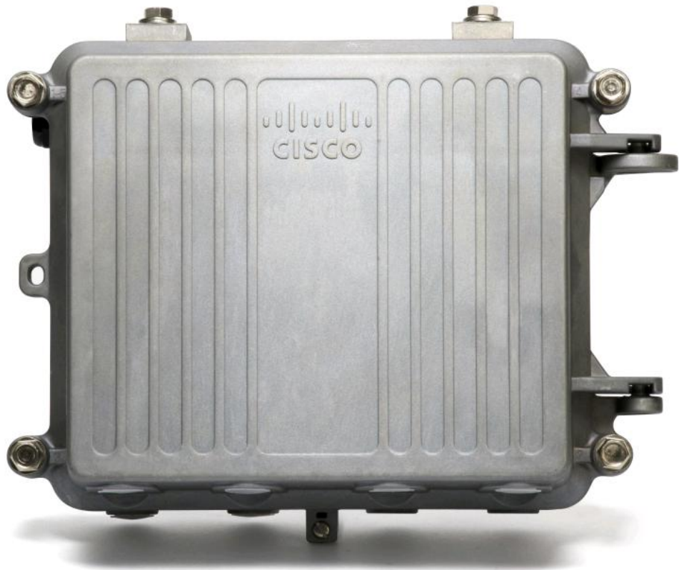
Figure 1. DigiStar Ethernet over Coax AP E230

The AP provides high-speed and reliable data transmission.