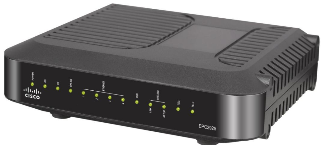
Figure 1. Cisco Model EPC3925 8x4 EuroDOCSIS 3.0 Wireless Residential Gateway with Embedded Digital Voice Adapter (image may vary from actual product and specification)

The EPC3925 integrated router features a Dynamic Host Configuration Protocol (DHCP) server, Network Address and Port Translation (NAT/NAPT) and a Stateful Packet Inspection (SPI) firewall. These features allow the user to share a single high-speed public Internet connection as well as share files and folders between devices in the home network by attaching multiple wired and wireless devices in the active home or office to the wireless residential gateway.