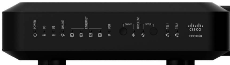
Figure 1. Example of Cisco Residential Wireless Gateway with Digital Voice Model EPC3928

The Cisco EPC3928 integrated router features a Dynamic Host Configuration Protocol (DHCP) server, Network Address Translation (NAT) and Network Address and Port Translation (NAPT), and a Stateful Packet Inspection (SPI) firewall. These features allow the user to share a single high-speed public Internet connection as well as share files and folders between devices in the home network by attaching multiple wired and wireless devices in the active home or office to the wireless residential gateway.