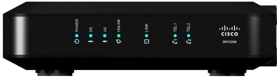
Table 1. Front Panel Features