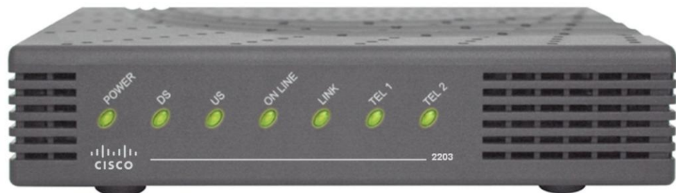
Figure 1. Cisco Model EPC2203 EuroDOCSIS 2.0 Cable Modem with EMTA (image may vary from actual product and specification)

The EPC2203 fully supports the CODECs specified in EuroPacketCable 1.5. Additional CODECs are available through a software upgrade that includes a high fidelity CODEC option for toll-quality plus service. Standard VoIP call signaling is compliant with EuroPacketCable's (MGCP/NCS) specifications. Software upgrades are available to support Session Initiation Protocol (SIP) call signaling.