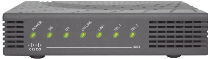
Table 1. Front Panel Features