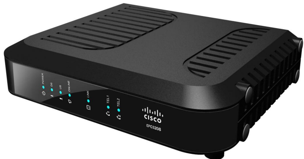
Figure 1. EPC3208 EuroDOCSIS 3.0 8x4 Cable Modem with Embedded Digital Voice Adapter (image may vary from actual product and specification)

The EPC3208 is designed to meet EuroPacketCable™ 1.5 and EuroDOCSIS 3.0 specifications as well as being backward compatible with EuroDOCSIS 2.0, 1.1, and 1.0 networks. The EPC3208 fully supports the CODECs specified in PacketCable 1.5. Additional CODECs are available through a software upgrade that includes a high-fidelity CODEC option for toll-quality plus service. Standard VoIP call signaling is compliant with PacketCable (MGCP/NCS) specifications. Software upgrades are available to support Session Initiation Protocol (SIP) call signaling.