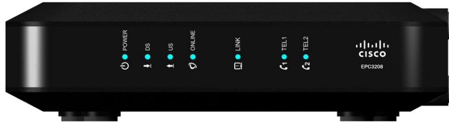
Table 1. Front Panel Features