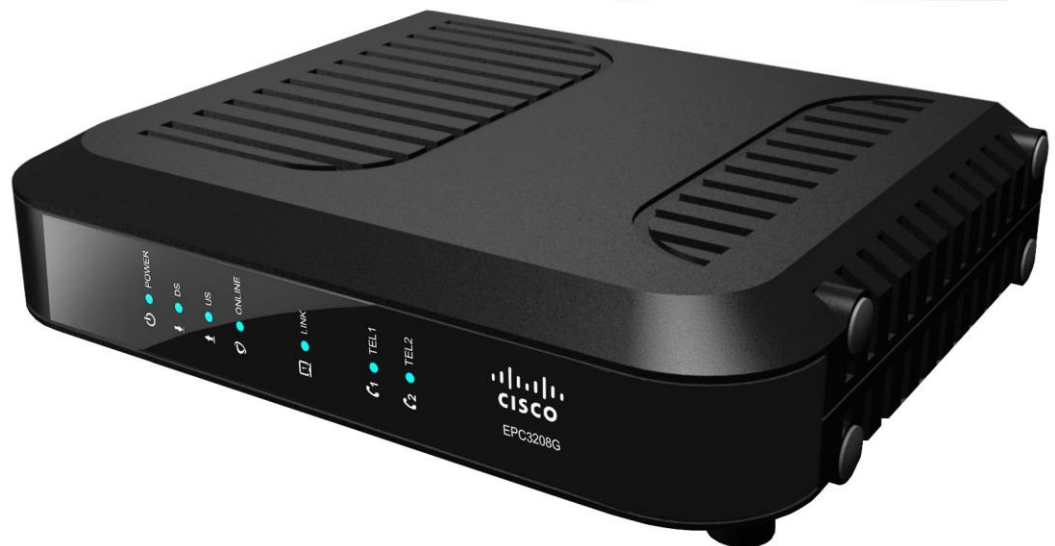
Figure 1. EPC3208G EuroDOCSIS 3.0 8x4 Cable Modem with Embedded Digital Voice Adapter (image may vary from actual product and specification)

The EPC3208G integrated router features a Dynamic Host Configuration Protocol (DHCP) server, Network Address and Port Translation (NAT/NAPT), and a Stateful Packet Inspection (SPI) firewall. These features allow the user to share a single high-speed public Internet connection as well as share files and folders between devices in the home or small office network by attaching multiple wired devices to the cable modem.