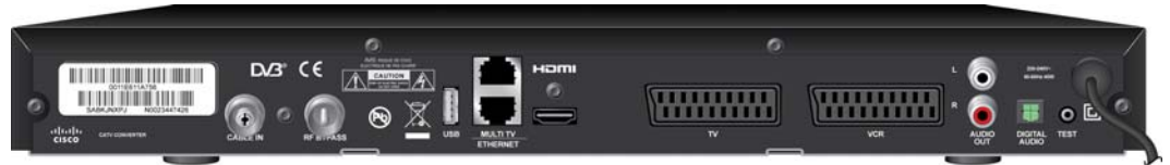
Table 2. Back Panel Features