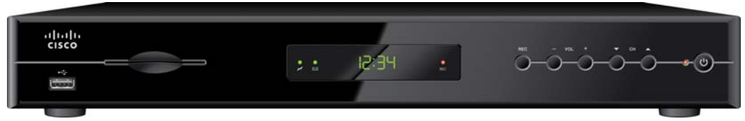
Table 1. Front Panel Features