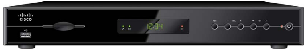
Figure 1. Cisco 8485DVB MPEG-4 HD DVR (image may vary from actual product and specification)

The 8485DVB is compliant with DVB-C standards, MPEG-2 and MPEG-4 standards, supports PAL video formats, and is designed to be compliant with the required safety, emissions, and immunity specifications (as per the mandatory laws that may be applicable to Cisco). With its SmartCARD reader, it is built to support renewable security.