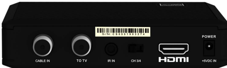
Table 2. Back Panel Features