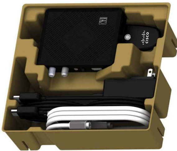
Figure 5. DTA 170HD with IR Accessory Kit in Self-Install Kit