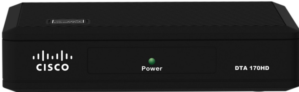
Table 1. Front Panel Features