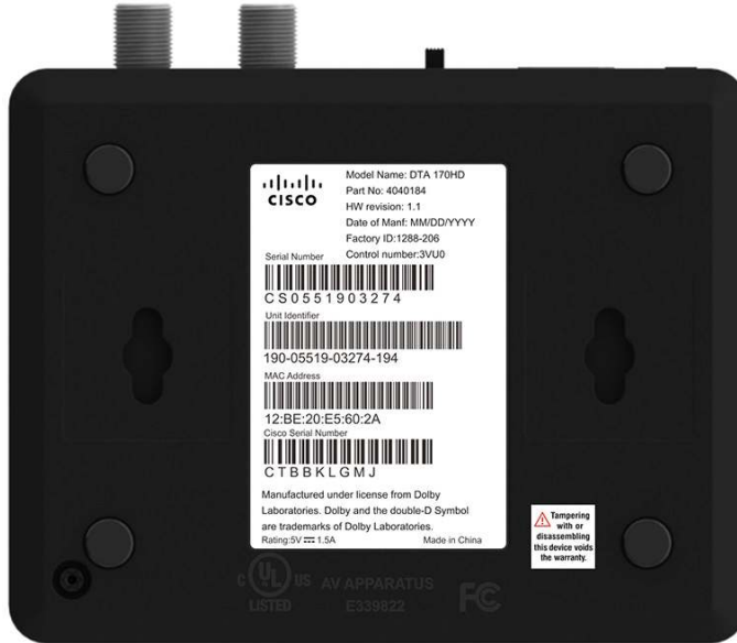
Figure 4. DTA 170HD Bottom Panel