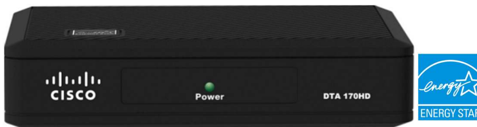
Figure 1. DTA 170HD

The DTA 170HD has earned the ENERGY STAR® 1 .