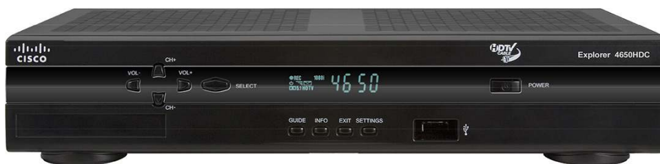
Table 1. Front Panel