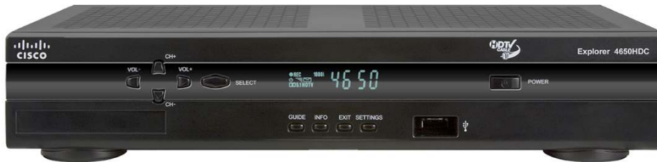
Figure 1. Cisco Explorer 4650HDC Front Panel (Image May Vary from Actual Product and Specification)

The 4640HDC and 4650HDC set-tops support the tru2way™ (formerly OCAP™) and Federal Communications Commission (FCC) mandates for separable security. The set-tops also offer MPEG-4 (H.264) high definition (HD) and standard definition (SD) decoding with HD and SD outputs and DOCSIS® 2.0 data capability. The 4650HDC set-top also provides analog tuning.