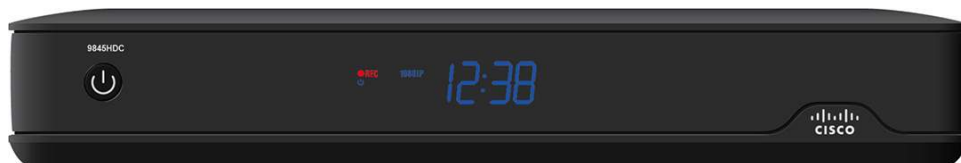
Figure 1. Cisco Explorer 9845 Video Gateway Front Panel (image may vary from actual product and specification)